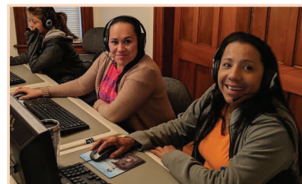
New online testing is an investment in student outcomes.

Testing is one way we measure impact. Assessments measure and monitor student improvement over time. This year we have transitioned from paper to computer testing for ESL students. The online system is helping teachers target instruction to the needs of each student.